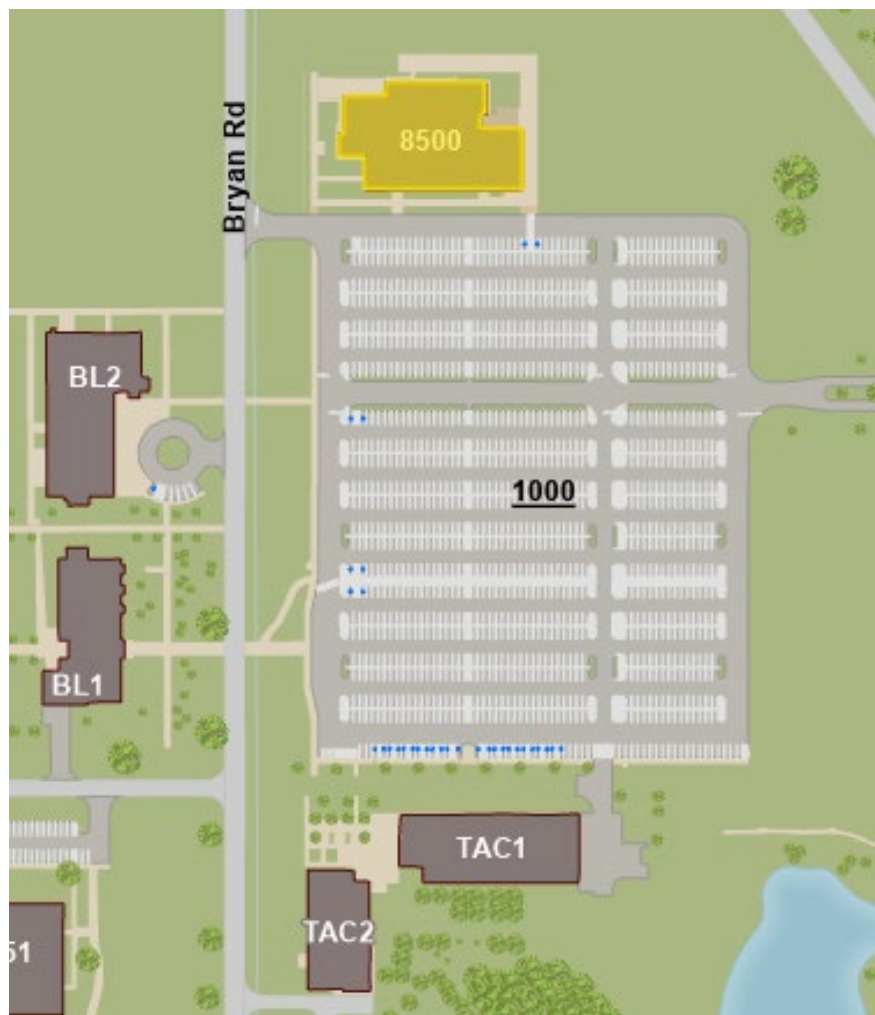
STEM building 8500 – in yellow

A parking permit or pay by the hour visitor parking is required for parking in Lot 1000. You can have either a RELLIS parking permit or a TAMU main campus parking permit (for any lot). Those with Texas A&M permits including daily, weekly and monthly permits who have registered their license plate may park in all areas at RELLIS for no additional cost (except: Blinn Employee Lot, TEEX Law Building Lot and behind the secure fence line on Flight Line Rd). Night permits are only valid from 5pm–6am.